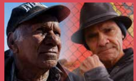
Characters: Kevin and Lucky Keepers of traditional customs and lore.