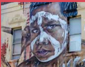
Character: Tyrone Streetwise beyond his years.