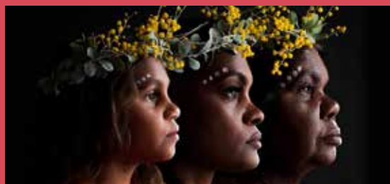
Characters: Tracey, Joyce and Auntie Isabelle They bring their ancient songs and stories to the fire.